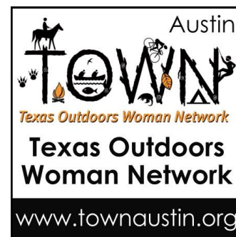
4"x4" sticker ($1.25 ea.)