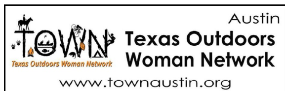
3"x11" car magnet ($4.00 ea.)

Put 'em on your car, your kayak, your tent, your cooler, or RV!