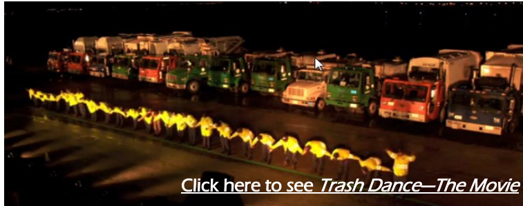
Click here to see Trash Dance—The Movie