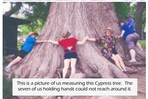
This is a picture of us measuring this Cypress tree. The seven of us holding hands could not reach around it.